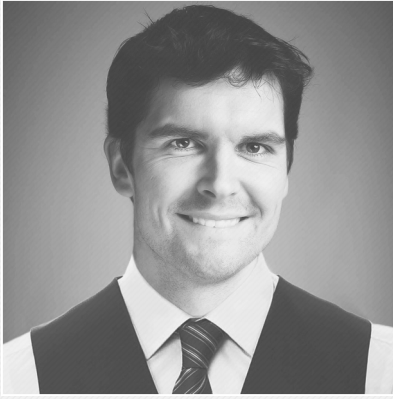
B R I A N W E L C H